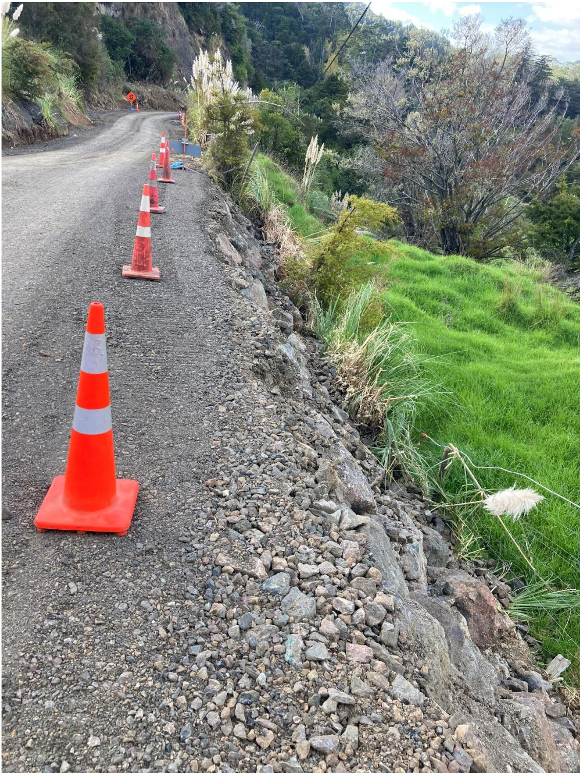
Slip repair completed on Kauaepepe Road by Joe Pomare's Boss Logging crew.