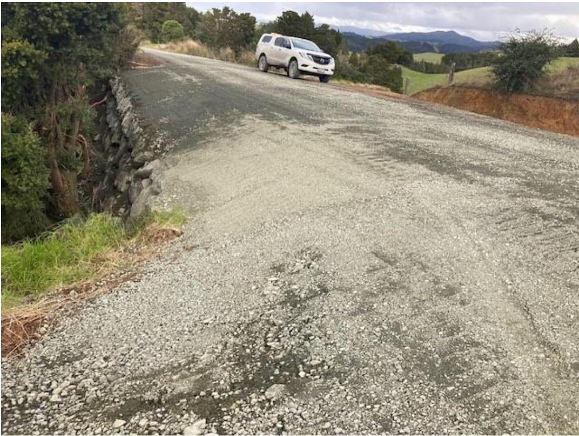
Slip repair completed on Taratara Road by Jecentho Contracting Excavator Operator Roger Frear and crew.