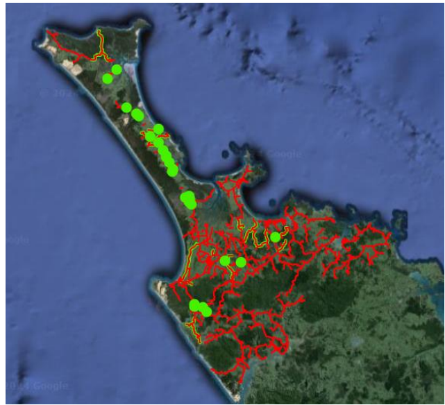
Figure 3: Locations of grading completed (green)