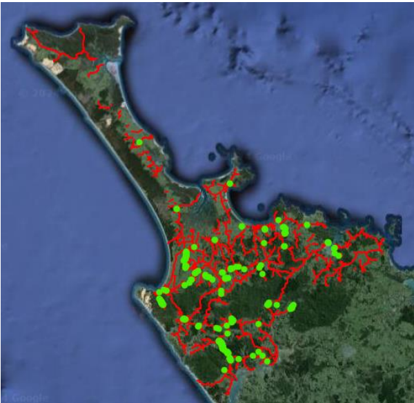
Figure 2: Locations of potholing completed (green)