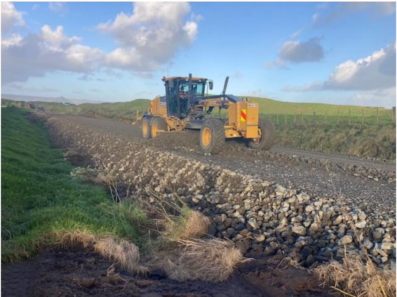
Figure 1: Resilience project completed on Spains Road to improve road access during flood events

Our people are our most important asset, the cover photo this month is of Rolly Noble (Construction Supervisor), his daughter Ana Nopera (Machine Operator) and his son Tipene Nopera (STMS). Creating a workplace where we are proud for our children to work at is one of our greatest successes for our branch.