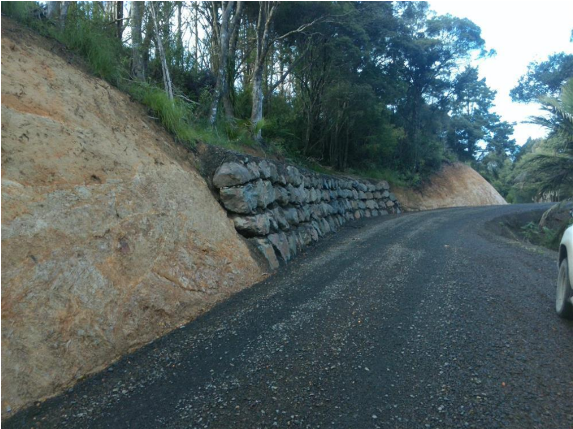
Over slip repair completed on Waiotehue Road by Far North Roading crew.