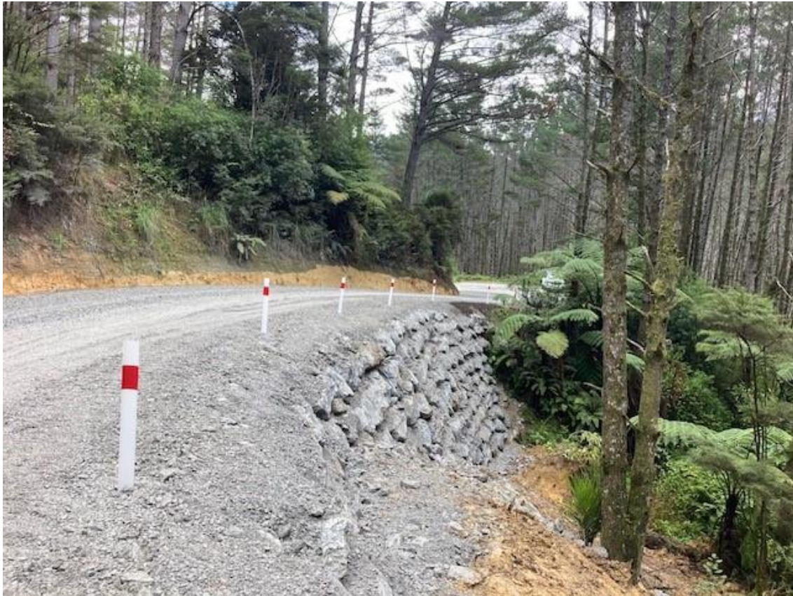
Slip repair completed on Iwitaia Road by FH Excavator Operator George Proctor and crew. Along with a rock spill under slip repair we also completed a culvert replacement / extension and water tabling while we were there. The photo below shows the original slip.