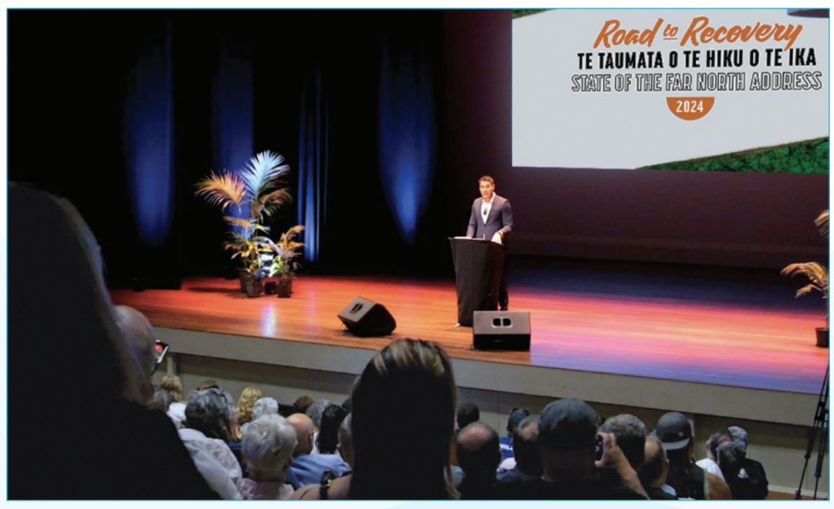
Road to Recovery was the theme of the address attended by more than 200 leaders from business, Te Ao Māori and the community.

The mayor outlined how those events, and the election of a new council in 2022, changed the way it does business.