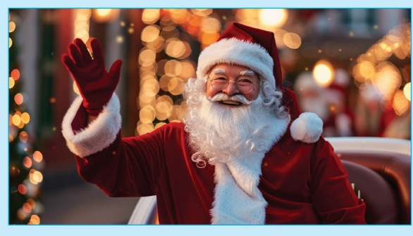
Santa will be spreading Christmas cheer right across the Far North.

Get in touch with us with details of any other Christmas parades that we can help promote.