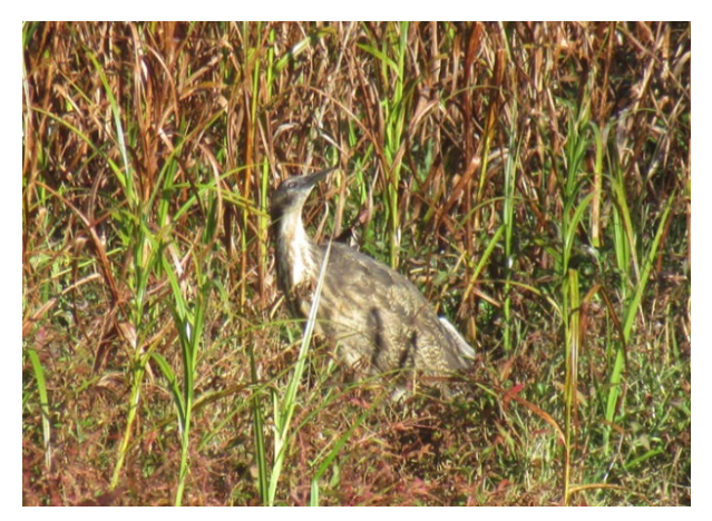
Bittern at Mill Road Kawakawa.