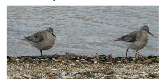
Red knot / Huahou on the Purerua-Mataroa Peninsula.

Their biggest threat is predation and loss of habitat, especially loss of roosting sites in China due to intensive land reclamation. It is a true privilege to have these rare birds visit the peninsula. Thanks to dedicated pest control work with Ngāti Torehina, local communities, businesses and farmers, pest numbers have plummeted making the peninsula an attractive and safe landing-pad for these international migratory birds. Clearing out the pests to make way for the return of such species is what it's all about!