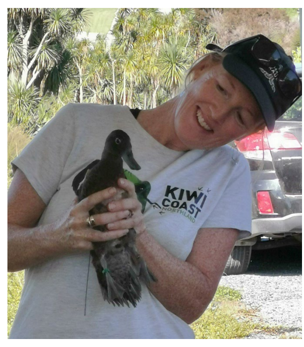
Kiwi Coast team shares a moment with one of the pāteke released at The Landing in March 2024.

We acknowledge that strong working relationships with Northland Regional Council and Department of Conservation staff, Save the Kiwi, companies, schools, hapū and iwi, landcare groups, volunteers and contractors are the way to collectively care for the environment, flora and fauna within it.