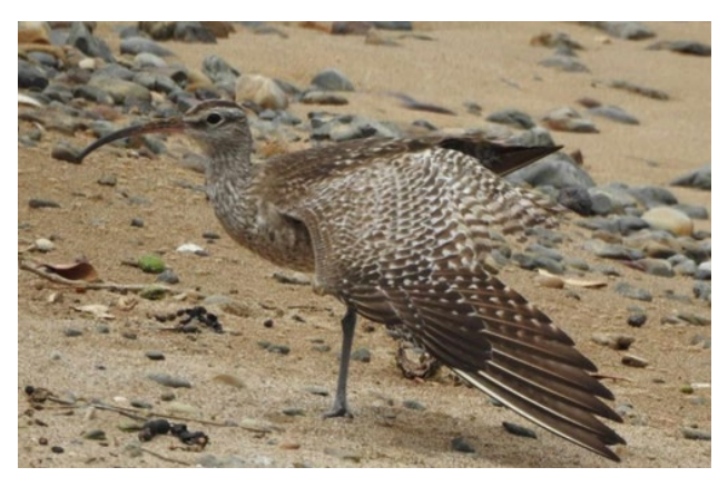
A Whrimbel visiting the Purerua-Mataroa Peninsula.