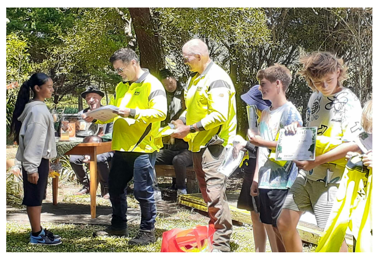
Bay of Islands Academy prize giving for Rat Squad students, December 2023.