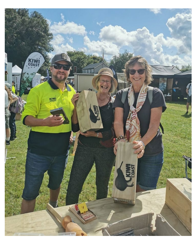
Kiwi Coast making rat trap boxes with visitors at the Bay of Islands show, November 2023.

Traps and bait stations were kept in stock in 2023/2024 which allowed the guick deployment to groups who requested resources. A new addition to the MNHVA this year has been the AT220 trap library. The high cost of these traps can be a barrier for some landowners, however they can deliver excellent results in areas where there are high possum numbers and can help with an initial pest knock-down. With the concept of a library system, landowners can borrow the trap for a few months at a time, and return it for servicing and loaning to a new area. This helps keep the traps fresh and active and maximise their use. Some landowners have also commented that after trialling an AT220, they are happy to purchase their own, after seeing the results.