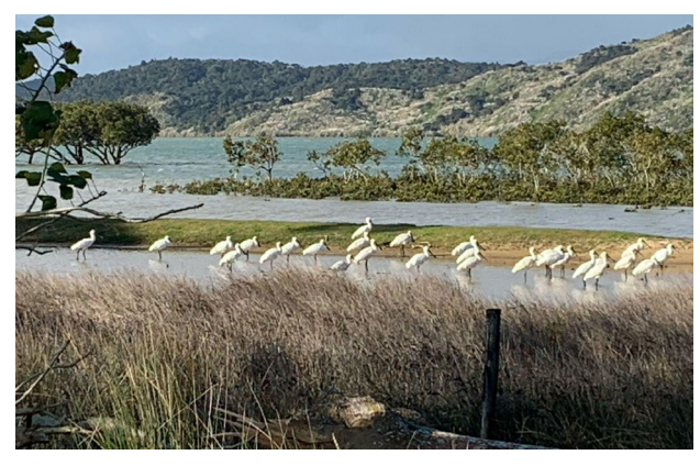
Spoonbill in the Hokianga Harbour.

Red Knot migrate from the Arctic (Russia and Siberia) each summer and travel down to Australia and New Zealand. In the 1990s it wasn't uncommon for 60,000 red knots to arrive in New Zealand around September, but that number has dropped dramatically.