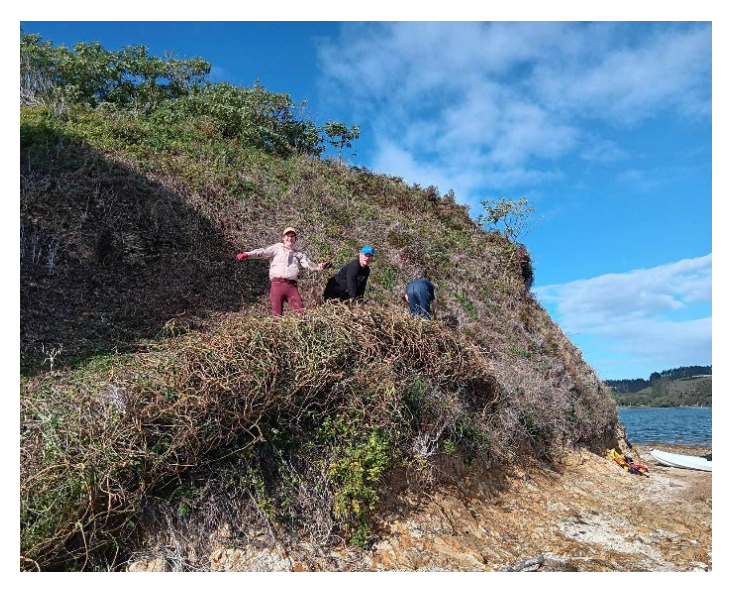
The STAMP team tackling Moth Plant on Taranaki Island, Kerikeri, May 2024. Photo: Anna Hewlett

Woolly Nightshade (Tobacco Weed) control, Taranaki Island, May 2024. Photo: Anna Hewlett