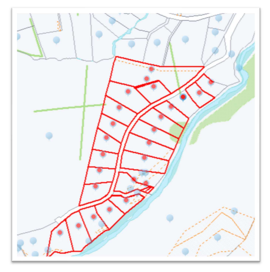
Figure 1 - Site

A plan showing the location of the land is provided at Figure 1 below.