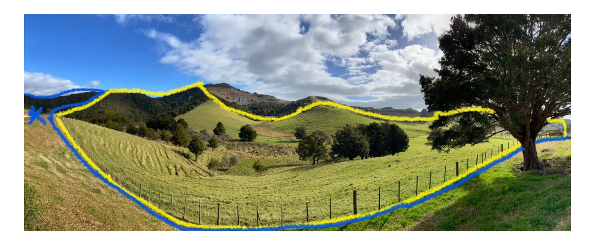
View from another property showing proximity and view of proposed quarry expansion.