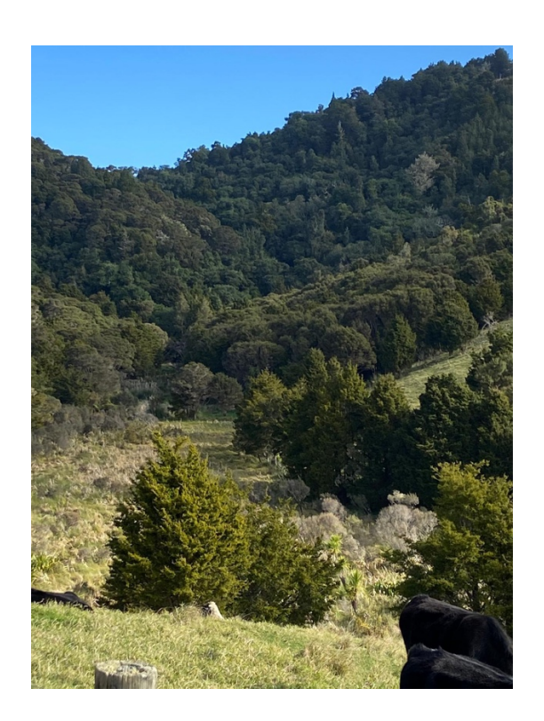
Images of watershed area included in the Proposal for expansion of the quarry

The quarry expansion will disrupt the delicate balance of our local watershed. The quarry's excavation will interfere with the current swamp and stream systems in this Lot and runoff will lead to erosion, sedimentation, and contamination of our water bodies. This will harm aquatic ecosystems, disrupt natural water flow patterns, and increase the risk of flooding downstream. The proposed footprint of the site impinges upon the delicate and untouched waterway, marshland and mature native forest and will no doubt have a significant affect on the survival of local swamp species, such as kiwi, pukeko, weka, morepork, hawks, frogs, eels, stick insects, geckos, aquatic plants, etc.