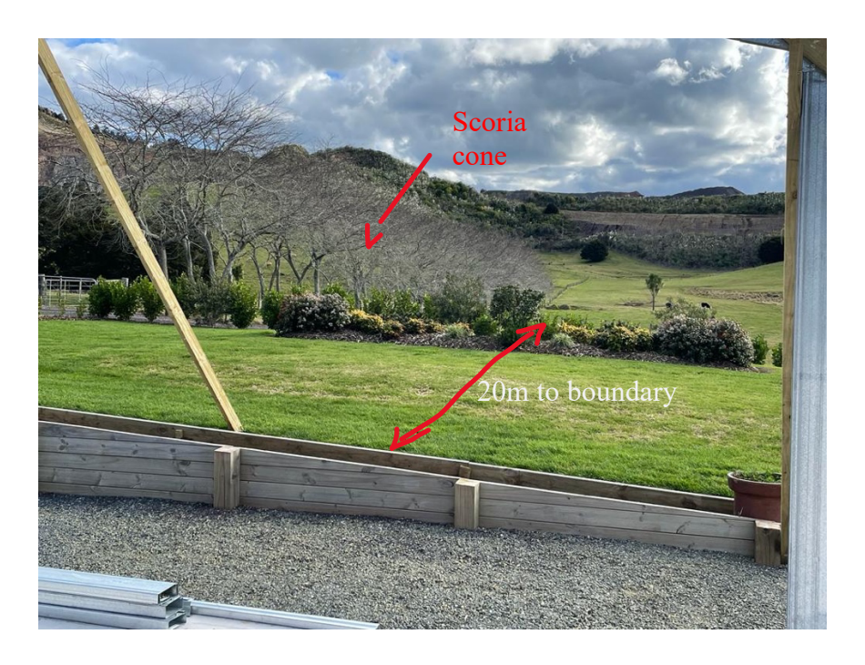
View from one property showing proximity of lounge window to proposed quarry location.