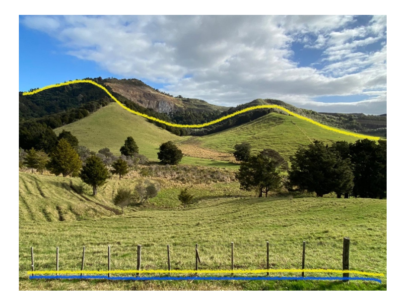
View from another property showing proximity and view of proposed quarry expansion.