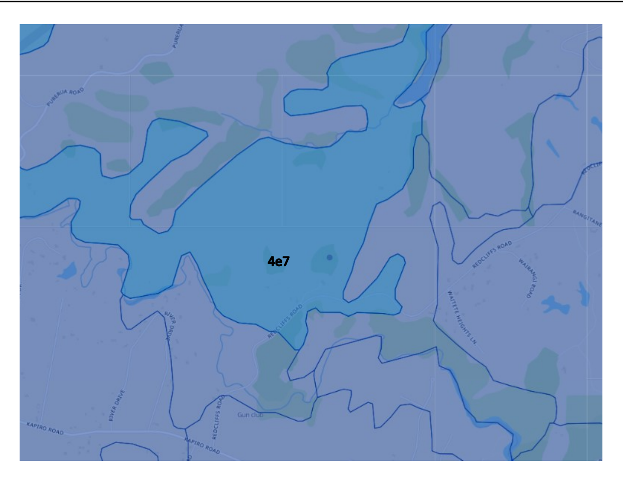
Figure 2: NZLRIS LUC soil class map