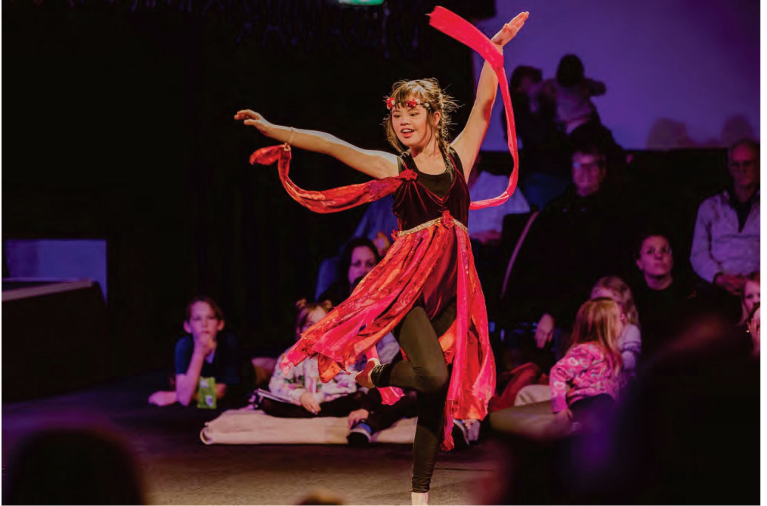
Glass Ceiling Arts Collective present The Lion King in Whangārei in 2023