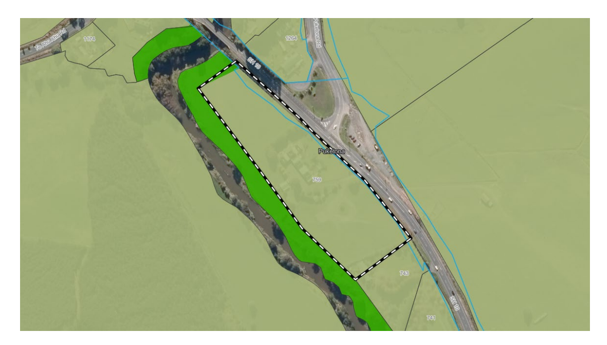
Figure 1 – PDP Zoning of the Site