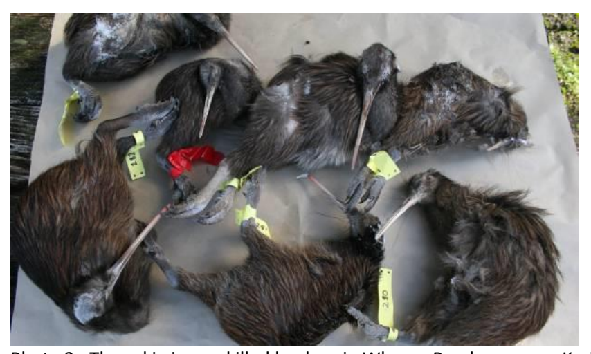
Photo 2: These kiwi were killed by dogs in Wharau Road area near Kerikeri.<sup>31</sup>