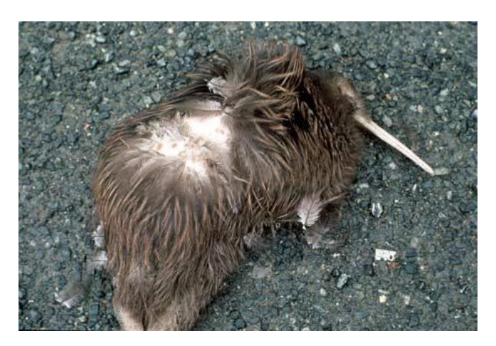
Photo 3: Kiwi killed by a dog in area clearly signposted as kiwi area where dogs must be kept on a lead. The newspaper article commented that 'some owners appear to be ignorant... or defiant'. <sup>32</sup>