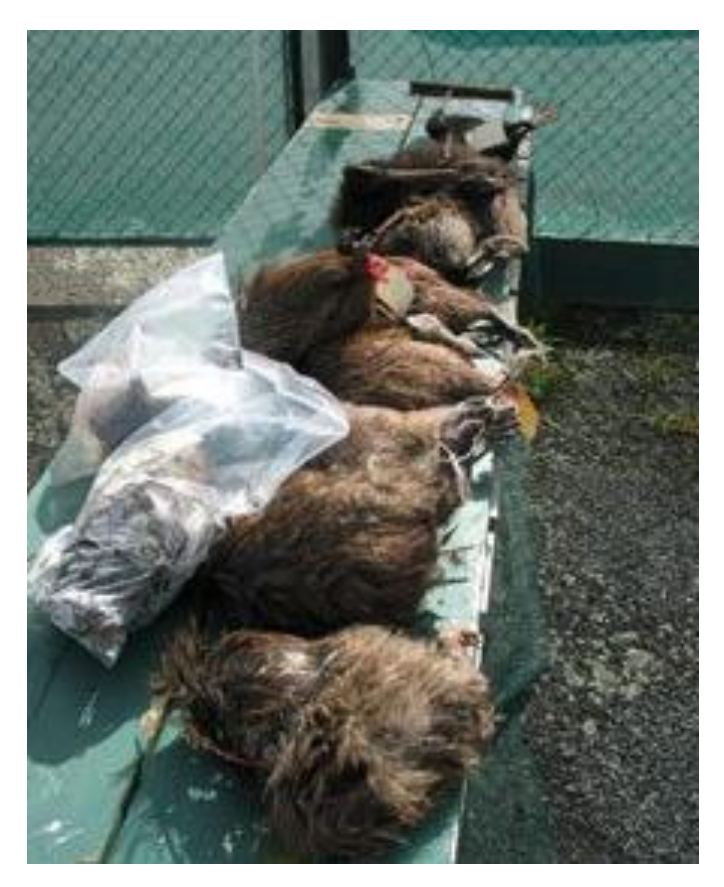
Photo 5: These kiwi were killed by one dog in a short period of time.<sup>34</sup>