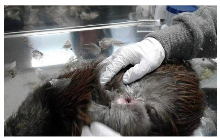
Photo 1: Kiwi killed by dog, found on Long Beach, Russell, June 2018. Autopsy report by Massey University confirmed that the bird's injuries were consistent with dog attack.<sup>30</sup>