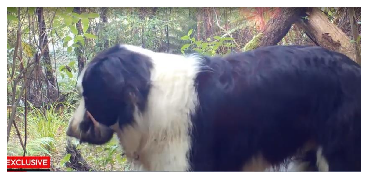
Photo 4: Kiwi chick was killed by being picked up in a pet dog's mouth, 2022. <sup>33</sup>