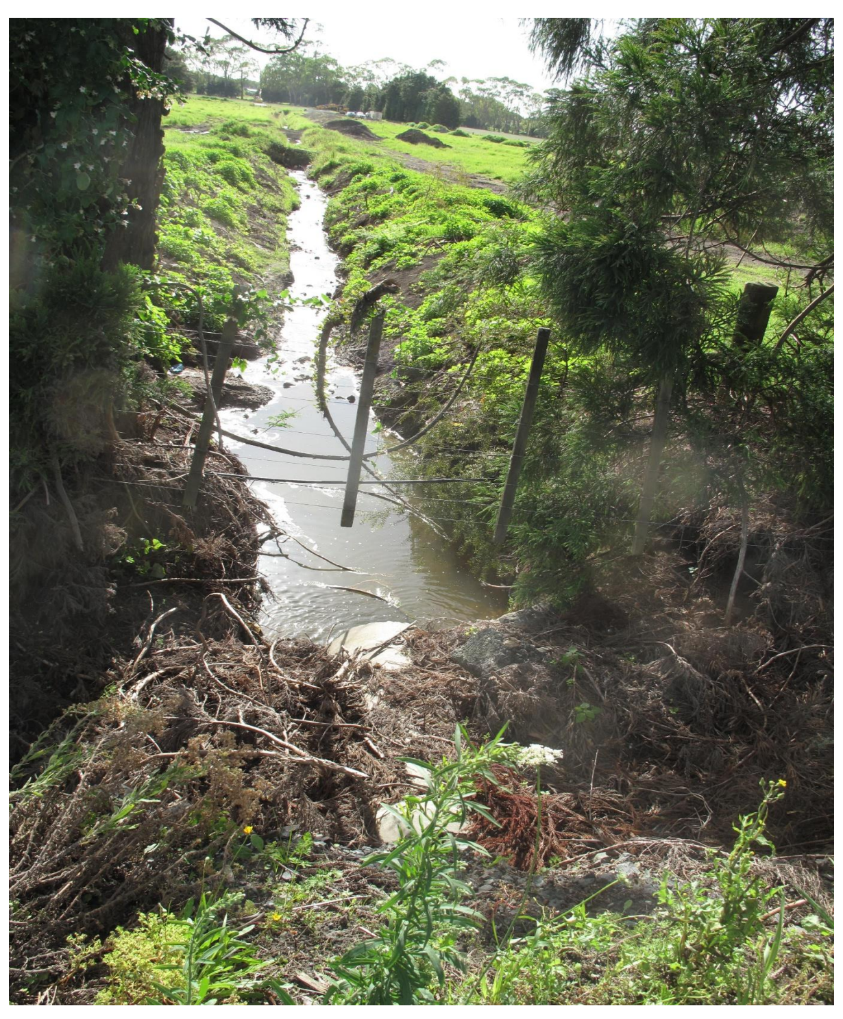
Discharge drain from an undersized culvert under SH10 intersection with Kahikatearoa Lane – the main access road to Waipapa Estate Background earthworks are preliminary work being undertaken for the new Far North District Council's Waipapa Sports Hub 3.