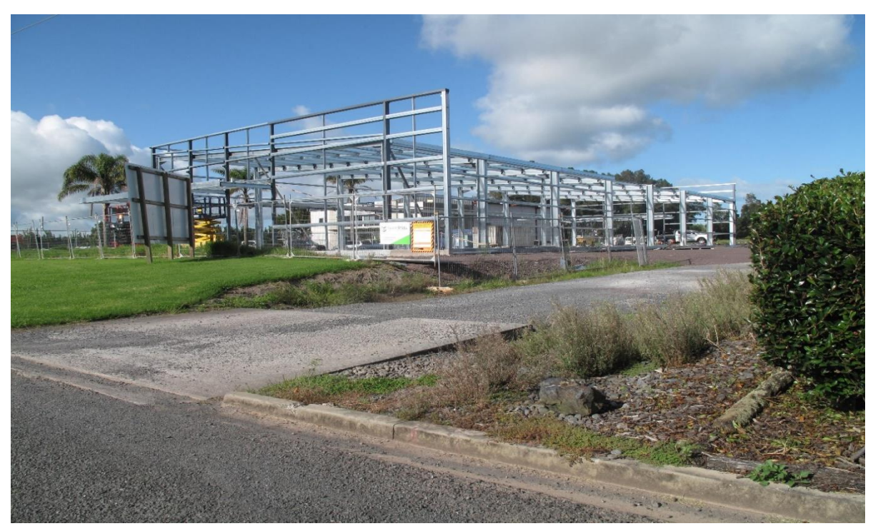
Above photo of New Commercial building under construction depicting raised building platform in Klinac Lane. Photo's taken February 2023 Lower Photo featuring extensive sealed parking areas that is common to the entire Waipapa commercial and industrial centre.