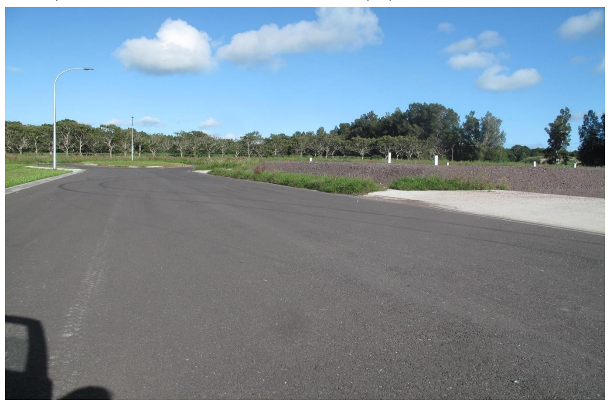
Photo depicting new extension of Kahiatearoa Lane Waipapa Industrial Area Note the new proposed hard-fill floor levels on property to the left of photo.

Since 1981 through to the present time, development has been rapid and extensive, especially with the establishment of the Waipapa industrial and commercial area – most situated within the Kerikeri river flood plain. The known potential of a future flood events has been designed for, by artificially raising local ground levels above any perceived future flooding event. This has had the effect, that the service roads now becoming a directional flood paths for future events. This will undoubtably impact the flow volumes and raise the intensity of the flow on downstream infrastructure and properties.