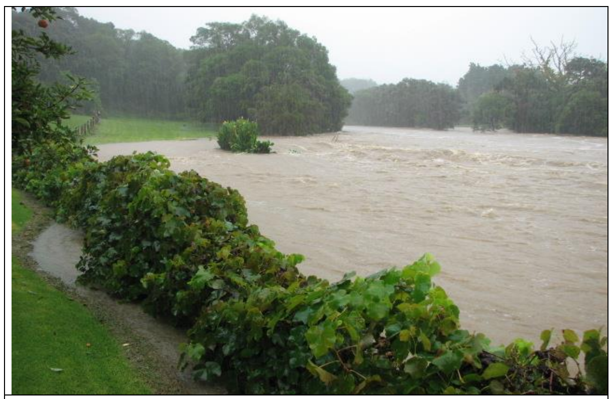
Kerikeri River Flood 2007 – near Kemp House

The area of concern is contained within the catchments and flood plains of the Waipapa River, Kerikeri River and the Puketotara Stream plus minor catchment streams and tributaries that connect to these main area river systems.