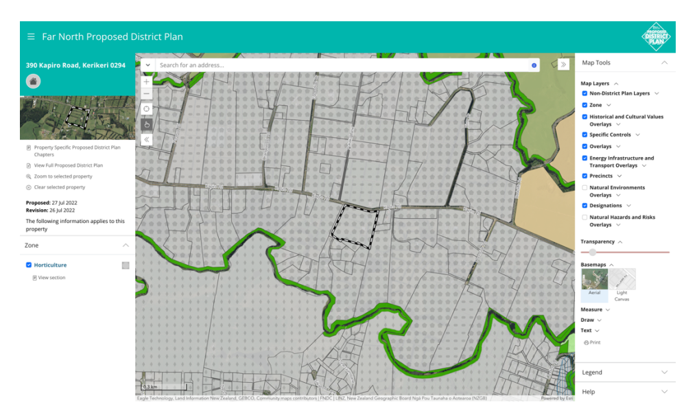
Figure 4 - Proposed Zoning

Notwithstanding the above, the NZLRI Land Use Capability Maps consider the site as having Class 3s2 soils – 'versatile' as per the Regional Policy Statement for Northland 2016.