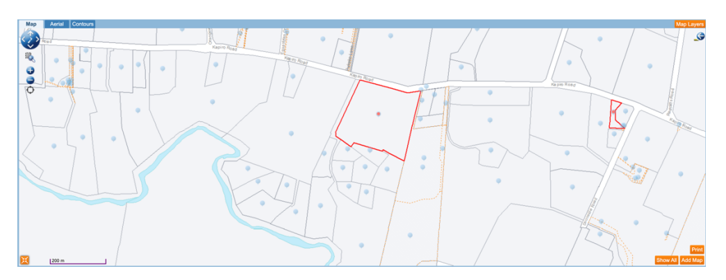
Figure 2 – Site & Surrounds

Figure 2 highlights the submission site, with the smaller site representing a landholding of at least ~2,500m2 in size.