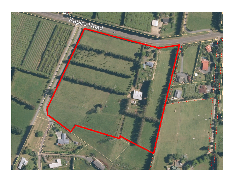
Figure 1 – Site

A plan showing the location of the land is provided at Figure 1.