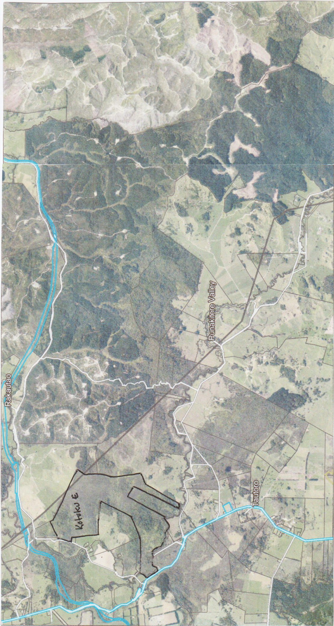
Kotuku E and links to other indigenous vegetation/forests and pine forests