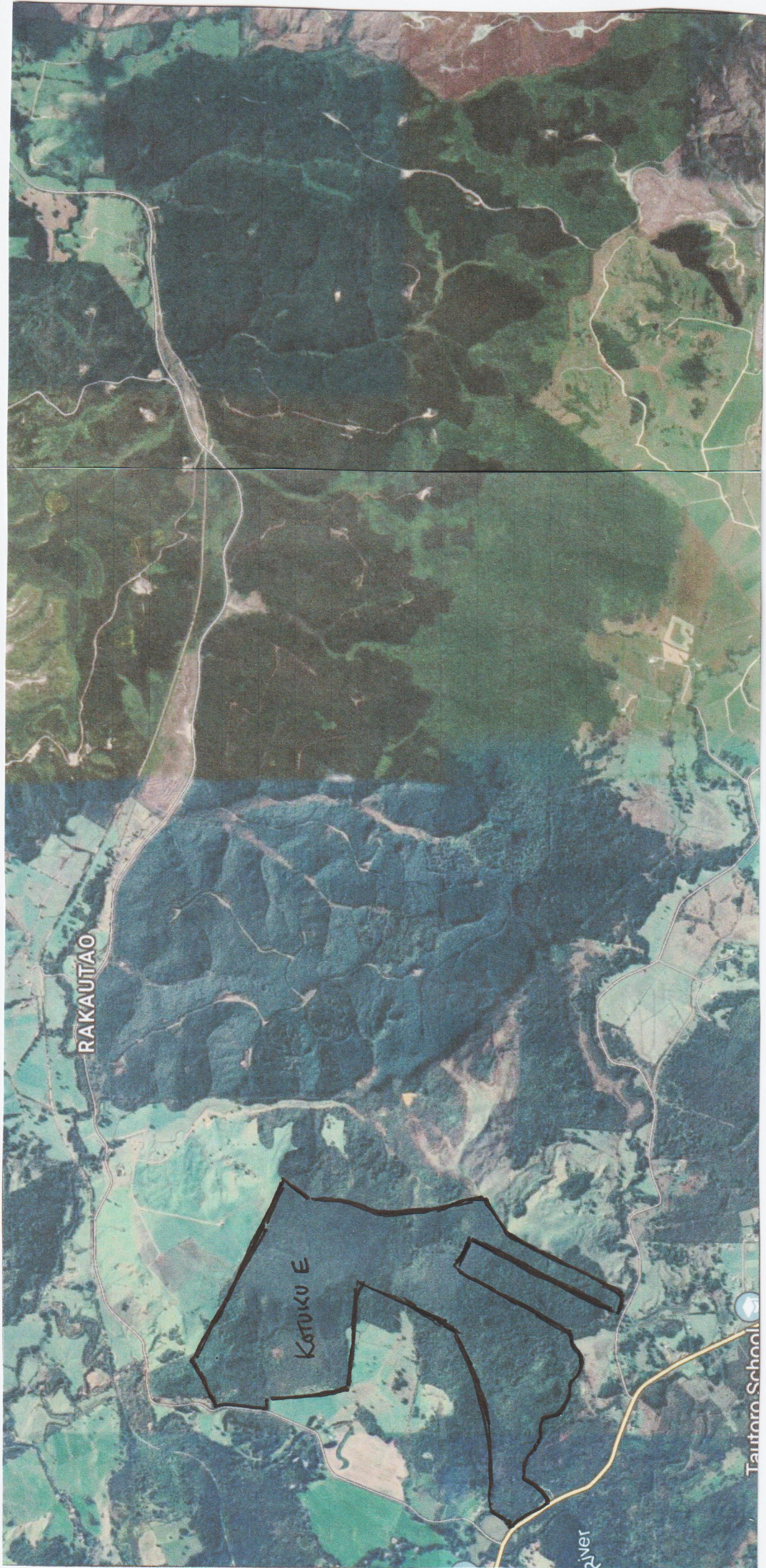
Fig 3 Showing the links previously between Kotuku E and other forest areas Shirley Adams