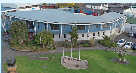
Renovations will boost council services at Procter Library.

Work to incorporate the Kerikeri Service Centre into Procter Library will kick off on Monday 10 March and run for about six weeks. Parts of the Procter Library will be remodelled to integrate service centre operations, which is expected to save ratepayers an estimated $250,000 over five years while improving service efficiency.