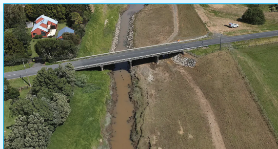
Quarry Rd bridge extension is part of wider flood protection upgrade.

An important bridge extension project closing Quarry Road in Kaitāia for 10 weeks began on Monday 3 March. A detour along Donald Road is in place during the Northland Regional Council works.