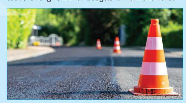
Two roading contracts in the Far North are being extended for a year.

This contract extension gives council staff time to develop and procure new contract models that reflect the shifting priorities on the Far North's roading network. Both contracts have been factored into the council's Long Term Plan budgets for 2024 and 2025.